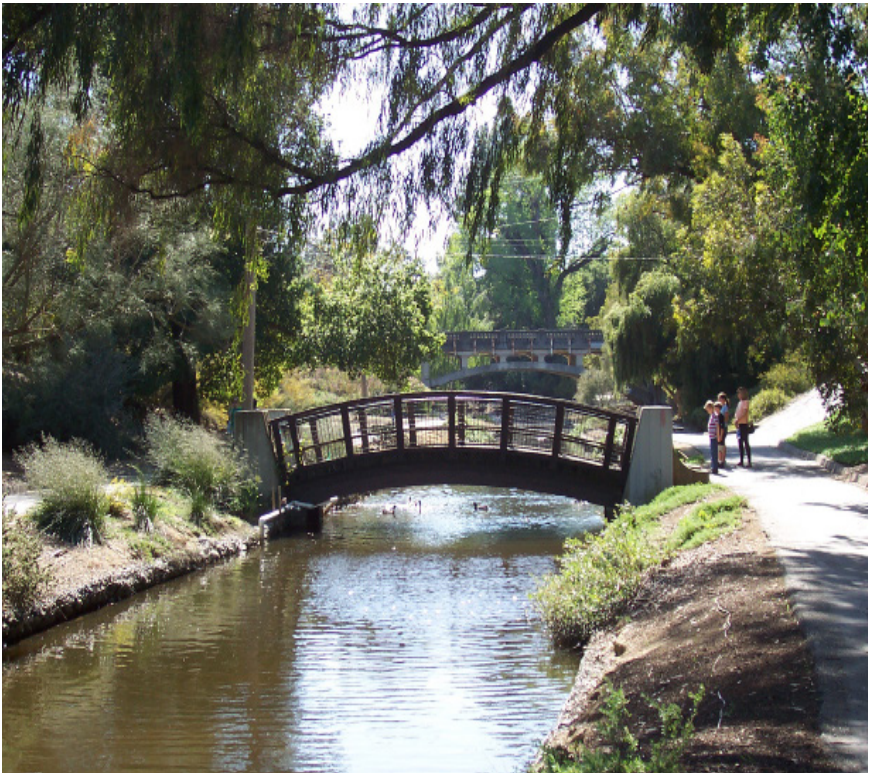
The UC Davis Arboretum

The city of Davis has been called the most “energy-conscious” city in the United States. It is an interesting, forward-looking city of about 65,600 located in California’s Central Valley. It lies 15 miles west of Sacramento, the State capital, and 75 miles northeast of San Francisco. Davis residents can take advantage of the recreational opportunities of Lake Tahoe, Northern Sierra Nevada, Napa Valley, and the beaches of northern California.